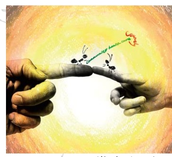
Build bridges by WA(2021

The word 'Human Services' is used when someone faces social challenges for 'help' or 'support' people. 'Human Services' is expanding rapidly its area such as field of social welfare, medical, nursing, clinical psychology related mental care, health promotion for aging society, assist family for infant and child care, special supporting education corresponding to vocational education, education support sector corresponding to era of lifelong learning and fluidization of employment corresponding to the area of career development.